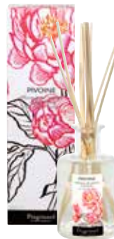
PIVOINE (PEONY) REF. N3213