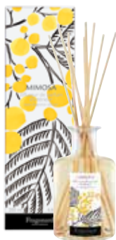
MIMOSA (MIMOSA) REF. N3201