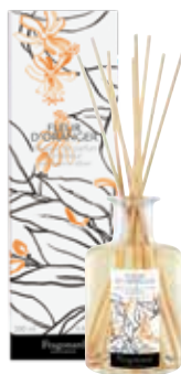
FLEUR D'ORANGER (ORANGE BLOSSOM) REF. N3204