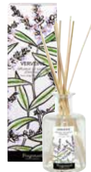
VERVEINE (VERBENA) REF. N3214

Diffusers delivered with 10 willow sticks. Do not burn the sticks. Dangerous. Follow instructions for use.