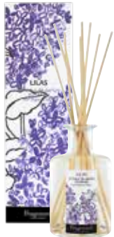
LILAS (LILAC) REF. N3205