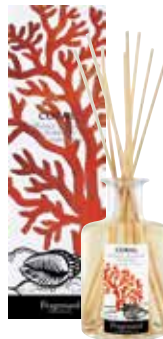
CORAIL (CORAL) REF. N3207