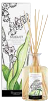
MUGUET (LILY-OF-THE-VALLEY) REF. N3202