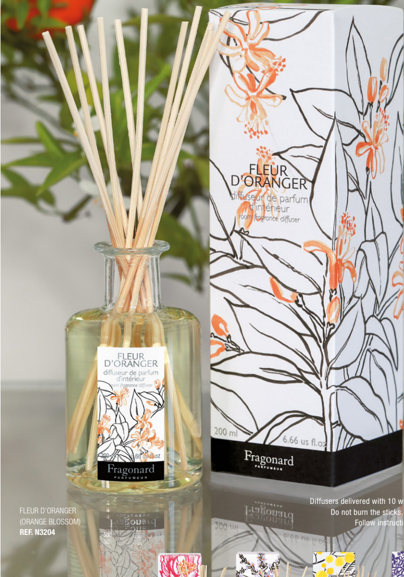
FLEUR D'ORANGER (ORANGE BLOSSOM) REF. N3204

Diffusers delivered with 10 willow sticks. Do not burn the sticks. Dangerous. Follow instructions for use.