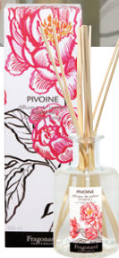
PIVOINE (PEONY) REF. N3213

200 ML BOTTLE + 10 STICKS €34 €30.60 (15.30*)