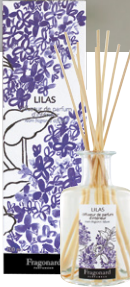
LILAS (LILAC) REF. N3205