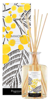
MIMOSA REF. N3201