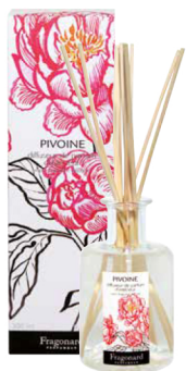
PIVOINE (PEONY) REF. N3213