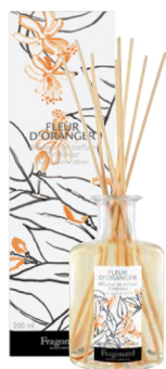
FLEUR D'ORANGER (ORANGE BLOSSOM) REF. N3204

Each diffuser comes with the home fragrance oil of your choice as well as 10 willow sticks to be placed in the bottle after removing the cap, for approximately eight weeks of continuous gentle diffusion.