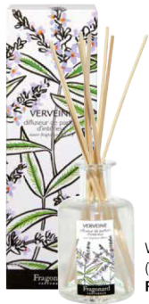
VERVEINE (VERBENA) REF. N3214